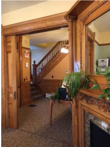
Entryway to NRB offices in Montpelier.

The NRB Executive Director undertakes managerial, administrative, and coordinating work for the Natural Resources Board, assists with policy formulation and goal setting, and is also responsible for the recruitment, training, and supervision of the State Coordinator and regionally based District Coordinators. The Executive Director is also involved in the preparation and delivery of statewide education and training for staff and appointed commissioners, development of publications and forms, and outreach to external partners and participants in the Act 250 process.